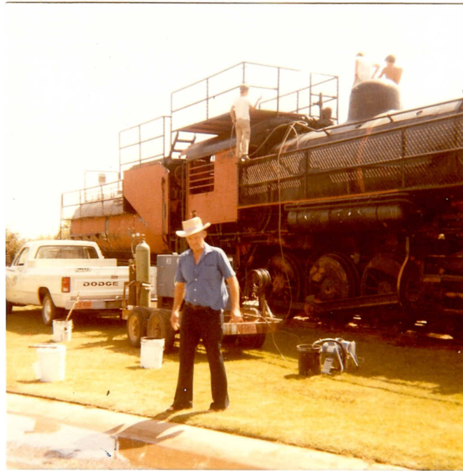
First coat of flat black with city generator and paint sprayer. Grandpa supervising.